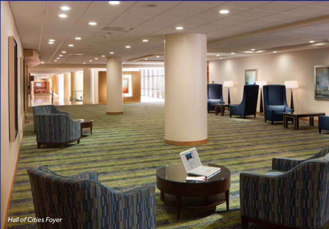
Hall of Cities Foyer

FOR INFORMATION, RATES & RESERVATIONS IN THE U.S., CALL 800.621.0683